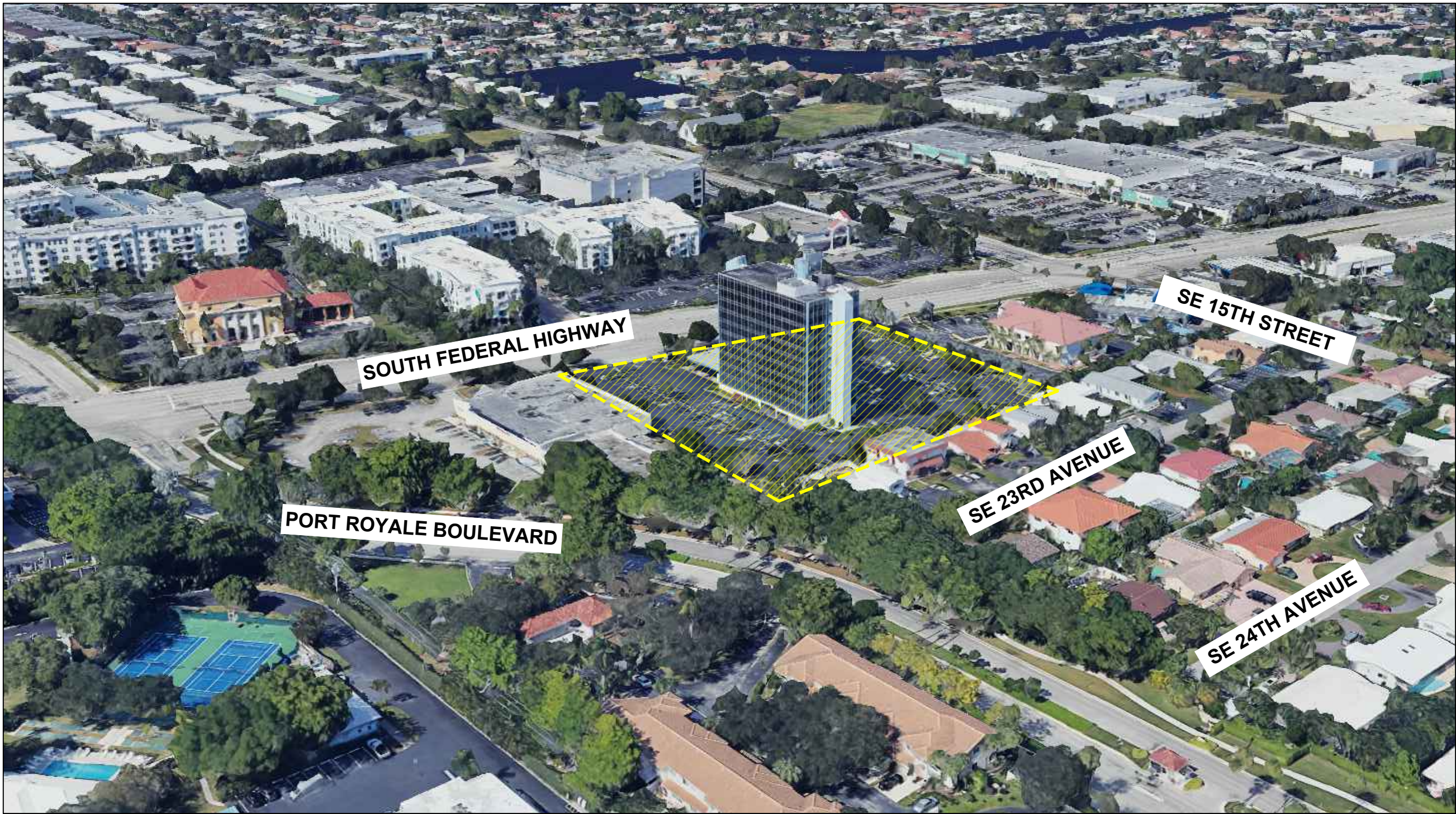
3D AERIAL VIEW - 2 (LOOKING NORTH - WEST)